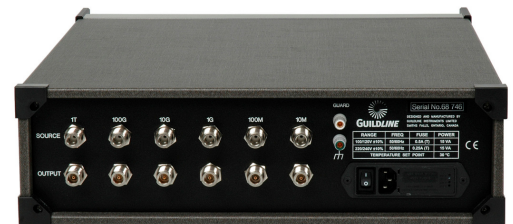
6636 Rear View

This automation and functionality provided by the 6535 System improves the calibration uncertainties, range of equipment that can be supported, and the efficiency of calibration laboratories and research facilities. The 6535 High Resistance Measurement System can either be operated manually or in a computerized mode via the Standard IEEE-488 communication. The included GUI based software program, TeraCal™, incorporates features and utilities that allow operators to improve measurement effectiveness and provide efficiency for data management. This includes the ability to perform automatic data acquisition, real time graphing of results, real time uncertainty analysis, history logging, charting, and regression analysis. All user definable test variables, such as resistance standard to use, excitation voltage, etc can be programmed on a per test basis. These features give users full control and flexibility in automating routine calibration procedures and maximizing workload capabilities.